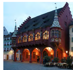
Historisches Kaufhaus, built in 1532